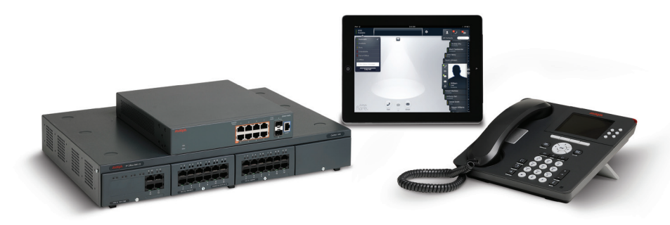
Figure 2: ERS 3500 with IP Office, the Avaya Flare® Communicator for iPad Device and an Avaya 9600 handset

installation script automates the entire set up process on the ERS 3500 switch by utilizing LLDP or ADAC functionality to automatically set up voice and data VLANs, QoS and policies on the IP Phones, meaning that IP Office and IP Phones are ready to be connected immediately. This helps ensure fast setup and error free deployment according to Avaya best practices and consistency between different locations for large rollouts in multiple Branch Offices.