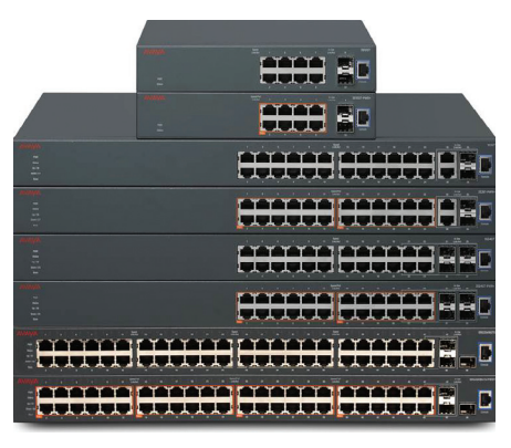
Figure 1: The ERS 3500 product family

A cost-effective, feature-rich solution, the ERS 3500 Series provides both standalone and stackable Ethernet switching perfectly suited to the unique requirements of Mid-Market and SME customers, as well as enterprise branch offices.